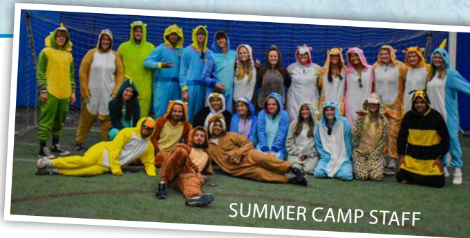
SUMMER CAMP STAFF